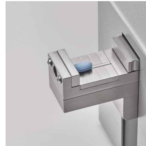
Quick-change tongue with groove for easy alignment of convex shapes

The highly accessible test area accepts all types of shapes, sizes, and materials. Optimized jaw movements provide short cycle times, while quick-change tongues allow for simple tablet handling by the operator. Clip-on jaws further extend the MT50 testing capabilities for 3-point bending strength tests or other testing methods.