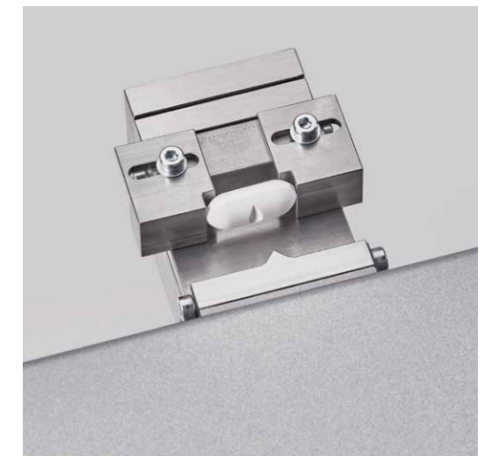
Clip-on jaws for 3-point bending strength test