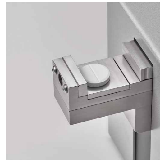
Quick-change tongue with flat surface