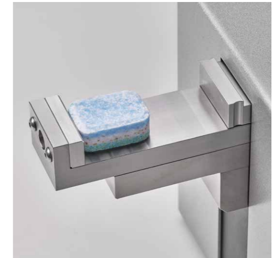
Extended jaw for testing large objects up to 65 mm