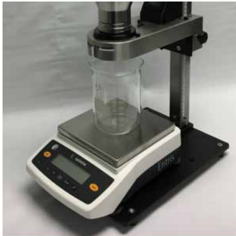
→ Discrete or continuous flow rate measuring