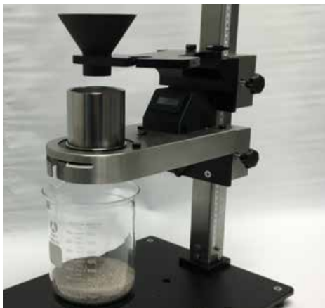
→ “Flow through an Orifice” with Cylinder setup