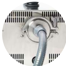
Hose Adaptor Connectors

The 6D can also be used for testing positive pressure systems using an optional hose adaptor. On-site routine maintenance is easy. And its integrated compressor makes implementation simple - all you need is a power source.