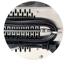
Power Cord Storage