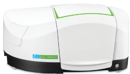
Spectrum Two N™ FT-NIR Spectrometer

For research use only. Not for use in diagnostic procedures.