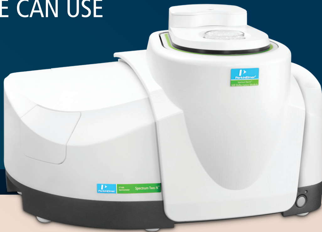
SPECTRUM TWO N